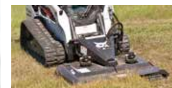
BRUSHCAT™ ROTARY CUTTER