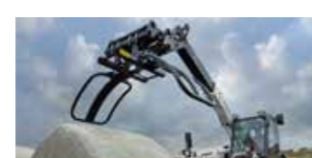
BALE SQUEEZE HANDLER