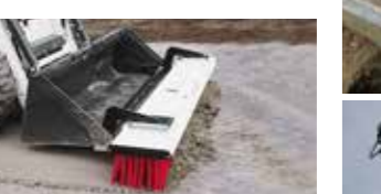
WHISKER PUSH BROOM