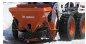
SALT AND SAND SPREADER